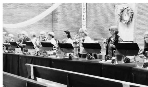
Bells of Peace