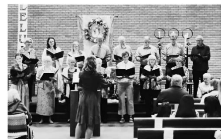
Voices of Peace Choir

"Let the message of Christ dwell among you richly as you teach and admonish one another with all wisdom through psalms, hymns, and songs from the Spirit, singing to God with gratitude in your hearts." -Colossians 3:16